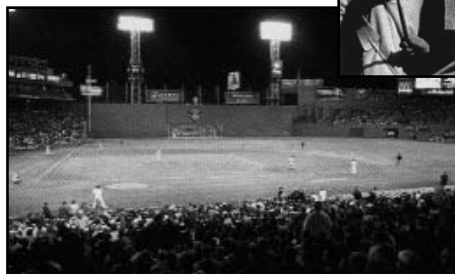
Boston Red Sox Stadium, Boston Massachusetts