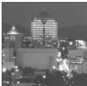
Albuquerque, New Mexico

THURSDAY, NOVEMBER 16, 2006 7:30 a.m. – 2:00 p.m.