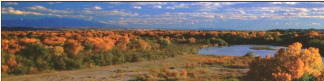
Rio Grande Valley