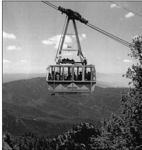
Sandia Peak Tramway – the world's Largest Aerial Tram

Next, you return to Albuquerque for a tour and wine tasting at an artisan winery. New Mexico's sun soaked soil and cool high desert nights are nearly perfect for